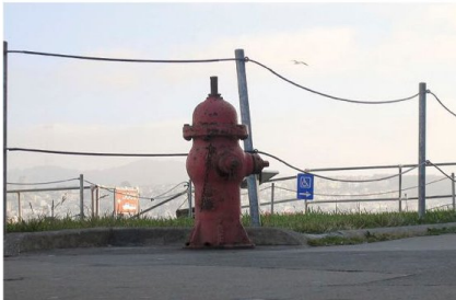
Figure 2. OK-VQA Example. Question: What vehicle uses this item? Answer: Firetruck. In our ontology Firetruck is related to FireHydrant by axioms e.g., Firetruck \sqsubseteq Vehicle \sqcap \exists hasWaterSupply.(ConnectionPoint \sqcap FireHydrant) .

which contains 14,031 images and 14,055 questions (see example in Figure 2). There are 768 seen classes and 339 unseen classes. The ontology is built with ConceptNet knowledge graph (Speer, Chin, and Havasi 2016) and a core \mathcal{EL}^{++} schema which has been operated on ConceptNet properties that connect answer concepts in OK-VQA questions. Specifically 2.3% of ConceptNet properties are involved. Figure 2 presents an example of VQA, where the potential answers of Truck and Firefighter are two seen classes in our ZSL setting while Firetruck is an unseen class.